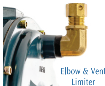
Elbow & Vent Limiter