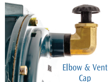
Elbow & Vent Cap